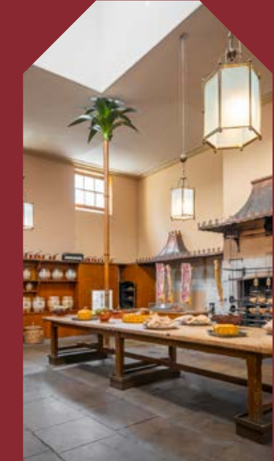
The Great Kitchen