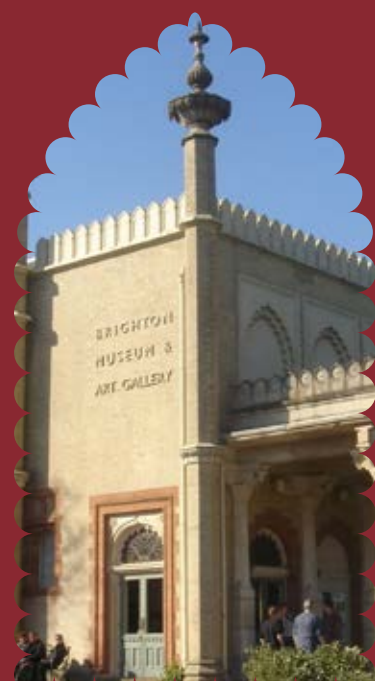
Brighton Museum & Gallery