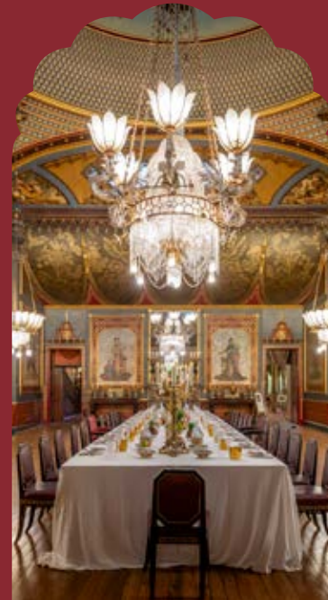
The Banqueting Room