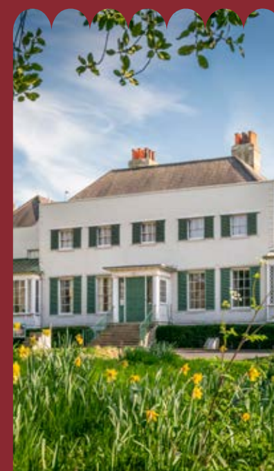
Preston Manor & Gardens