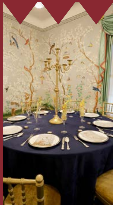
The King William IV Room