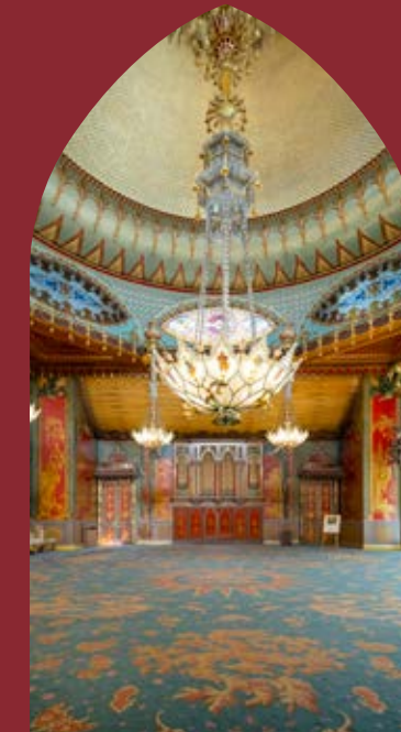
The Music Room