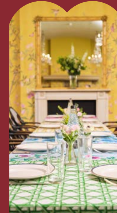
The Adelaide Suite