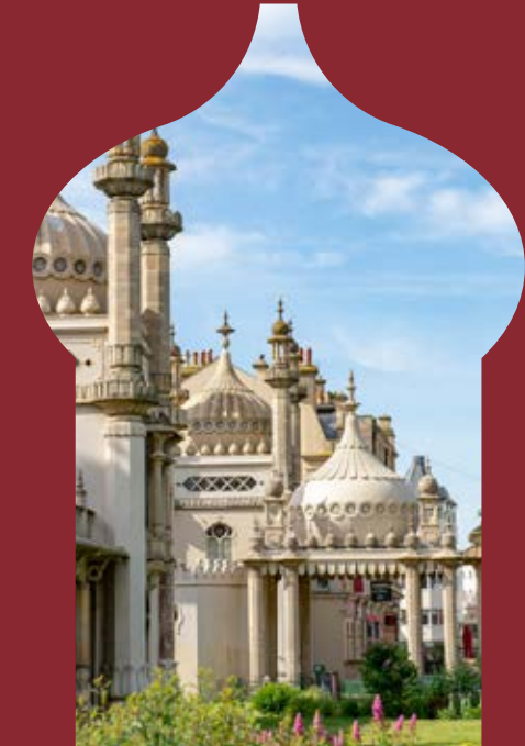
The King's Lawn