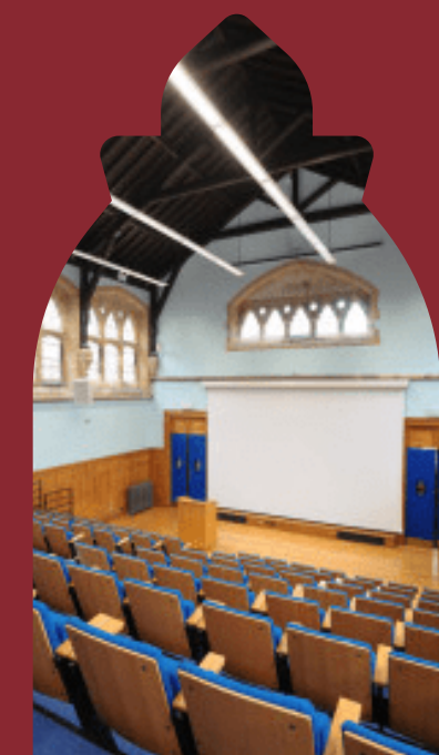
The Old Courtroom