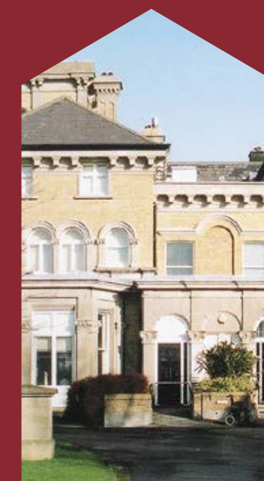
Hove Museum of Creativity