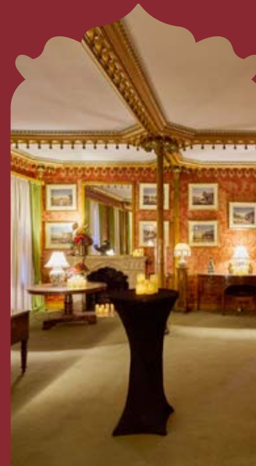
The Red Drawing Room