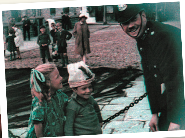
The Open Road (1924-1926)

Don't forget to collect a programme and take photos of your visit. Photography is welcome at Hove Museum, no tripods though.