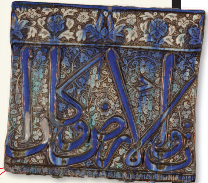
Persian tile, Brighton Museum

VISIT one or more of the Royal Pavilion and Museum sites.