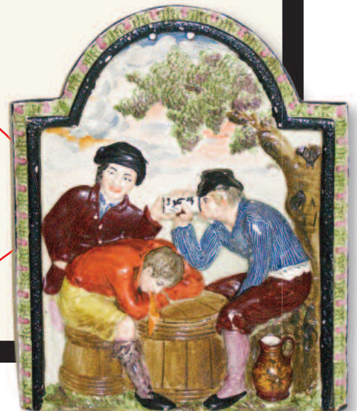
Wood Factory ceramic plaque, Brighton Museum