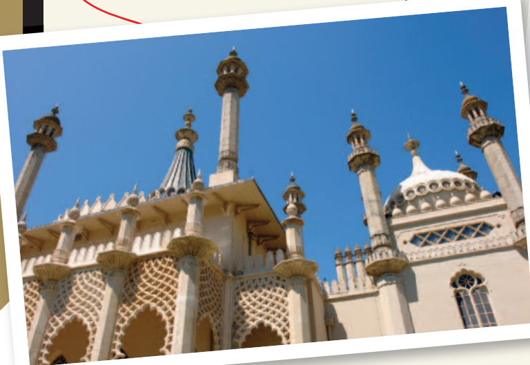
The Royal Pavilion

Don't forget to collect a programme, flyer or postcards. Sorry, photography is not permitted inside the Royal Pavilion ... outside is fine though!