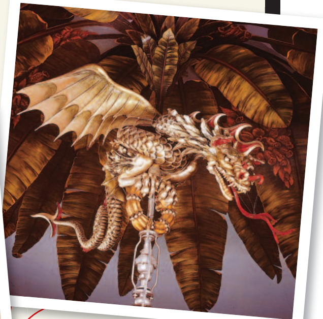
The Banqueting Room